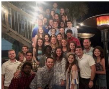
The Miami group (staff and students) shared one meal together at the end of the week to celebrate the trip!