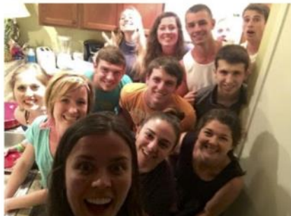
It is Miami tradition for men's condos to cook for the ladies on the PCB trip, below is our dinner group!

Back on campus I've gotten to enjoy my normal mentoring appointments and spend time with new students from our most recent interest surveys.