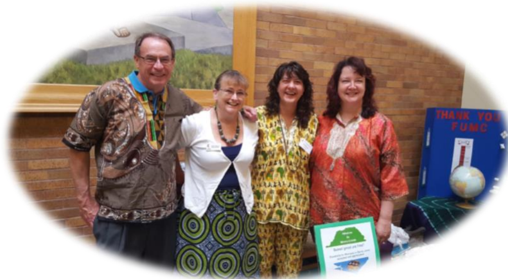
Sierra Leone 2019 Mission Team

Pick up a scrip order for at the Scrip box located in the gathering area by the stairwell or at the Sierra Leone Display in the tower hallway. Place your completed form and payment in the Scrip box in the gathering area.