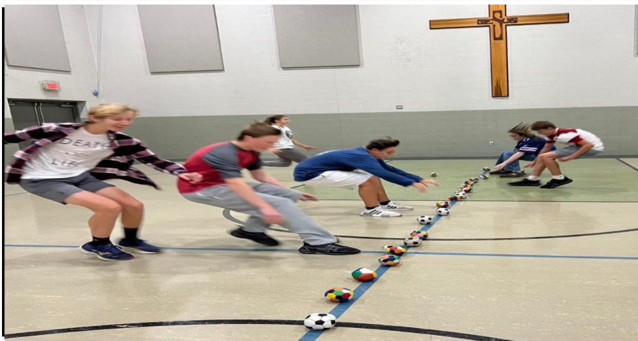
Practicing for Battleball Fall 2022