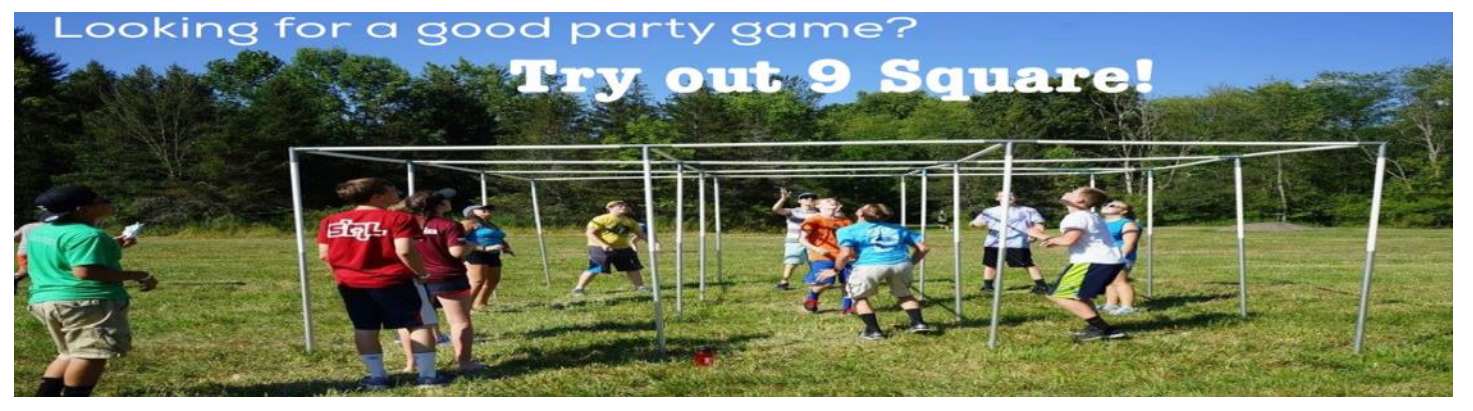
Looking for a game for a Birthday Party? Family Reunion? Grad Party?

IMPACT is a 5-day camping experience that focuses on cultivating a relationship with God and enhancing relationships within our youth ministry. Join us as we camp out in Tent City and daily make our way to the main stage for transformative worship, speakers, dramas, and dances, and end every night with a main stage band and a camp fire back at our camp site. Families are always encouraged to attend this event together with their youth but youth may also attend alone. If your family enjoys camping, this is a great way to spend time with your teenage kids and their friends in a Christian atmosphere. We encourage families to camp on site with us! Registration forms are located in the youth form area and on the church website.