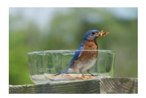
Galatians 6:9 (CEB)

<sup>9</sup> Let's not get tired of doing good, because in time we'll have a harvest if we don't give up.