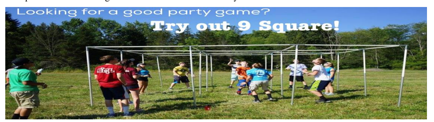
Looking for a game for a Birthday Party? Family Reunion? Grad Party?

IMPACT is a 5-day camping experience that focuses on cultivating a relationship with God and enhancing relationships within our youth ministry. Join us as we camp out in Tent City and daily make our way to the main stage for transformative worship, speakers, dramas, and dances, and end every night with a main stage band and a camp fire back at our camp site. Families are always encouraged to attend this event together with their youth but youth may also attend alone. If your family enjoys camping, this is a great way to spend time with your teenage kids and their friends in a Christian atmosphere. We encourage families to camp on site with us! Registration forms are located in the youth form area and on the church website.