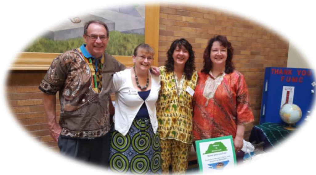
Sierra Leone 2019 Mission Team

Pick up a scrip order for at the Scrip box located in the gathering area by the stairwell or at the Sierra Leone Display in the tower hallway. Place your completed form and payment in the Scrip box in the gathering area.