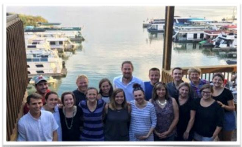
This is the 2016 Miami Staff team. We celebrated the end of our staff retreat with dinner on a lake nearby.

As the month progressed, I moved out to Oxford, settled in, had a 5 day all-staff training, and began my work as a Cru staff member! It was very surreal but all really exciting. We are gearing up for students to arrive on campus at the end of the month. Our 5-day staff retreat was a time to center ourselves around our vision, get training in full-time vocational ministry, prepare for our student leadership retreat, and connect as a staff team for the first time all together. It was truly a blessing to get to know the other staff members more personally and I feel incredibly privileged to be working along side and learning from each of them! Although it was a little nerve racking, I'm feeling more and more ready every day!