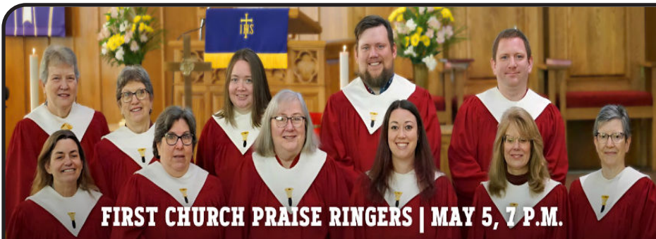
FIRST CHURCH PRAISE RINGERS | MAY 5, 7 P.M.

This year, the First Church Praise Ringers will host their second annual Handbell Mini-Camp in July. If you want to give ringing a try or learn more about it, this event is for you. Keep an eye out for more details.