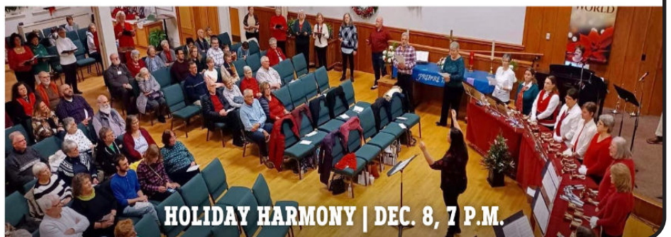
HOLIDAY HARMONY | DEC. 8, 7 P.M.