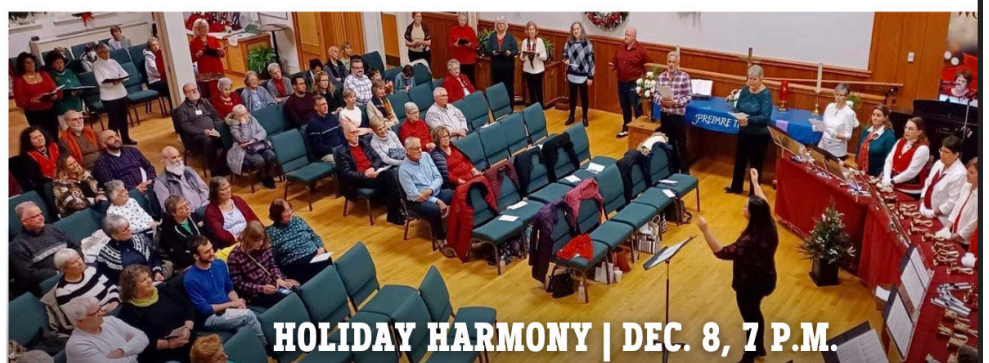
HOLIDAY HARMONY | DEC. 8, 7 P.M.