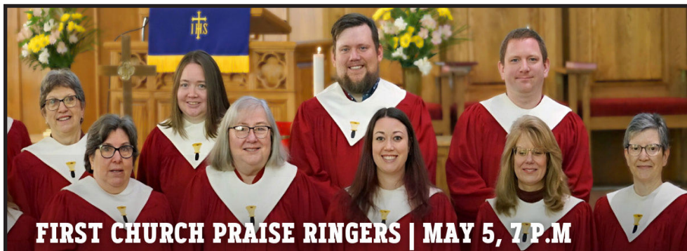
FIRST CHURCH PRAISE RINGERS | MAY 5, 7 P.M