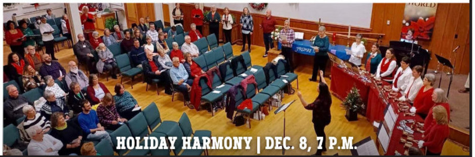
HOLIDAY HARMONY | DEC. 8, 7 P.M.

FIRST UMC MECHANICSBURG'S 2024 FREE CONCERT SERIES