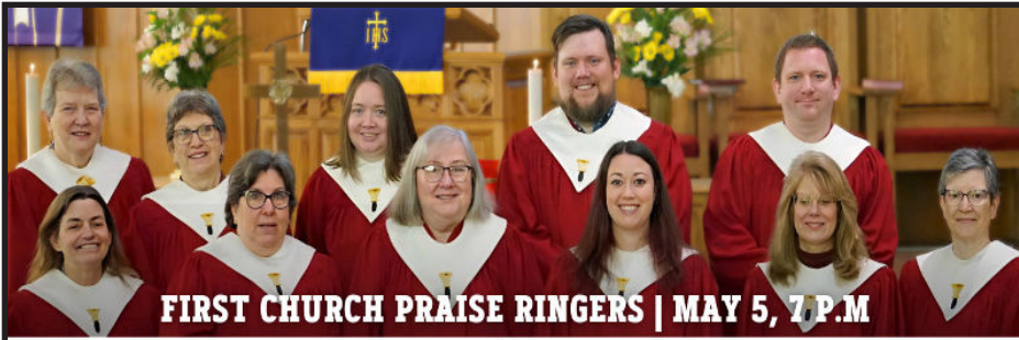
FIRST CHURCH PRAISE RINGERS | MAY 5, 7 P.M