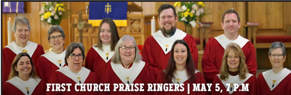
FIRST CHURCH PRAISE RINGERS | MAY 5, 7 P.M

First Church invites everyone to attend this “shush-free” worship experience that celebrates all expressions of worship and individuals of all abilities. This monthly service includes music, scripture, prayer and a brief message, along with refreshments and fellowship afterward.