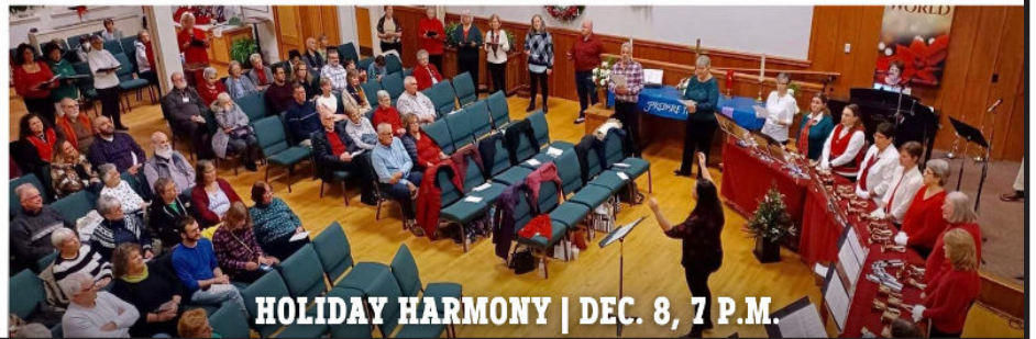
HOLIDAY HARMONY | DEC. 8, 7 P.M.