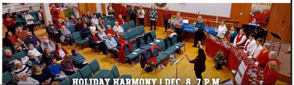
HOLIDAY HARMONY | DEC. 8, 7 P.M.

FIRST UMC MECHANICSBURG'S 2024 FREE CONCERT SERIES