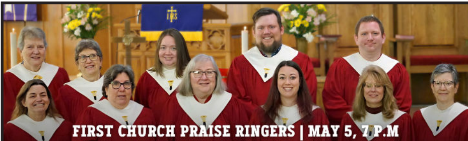
FIRST CHURCH PRAISE RINGERS | MAY 5, 7 P.M